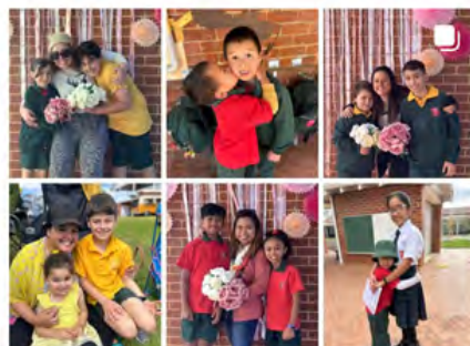
Siblings & Families