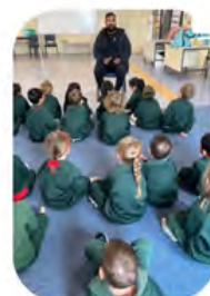
With Uncle Boyl