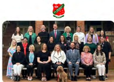
Our Amazing St Michael's Staff

https://www.instagram.com/stmichaelsbassendean